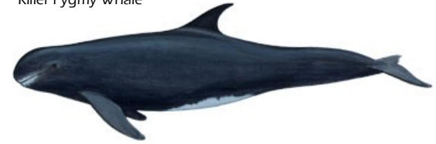
Killer Pygmy Whale

There are many species of whale that live in Caribbean waters or migrate through on their way to feeding or breeding areas. Whale watchers in the Caribbean regularly see dolphins, Short-finned Pilot whales, Humpbacks, Sperm Whales, Pigmy Killer and Melonhead Whales.