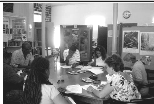
The Project Management Committee in meeting

Work on the GEF/SGP Reef Monitoring Project has advanced over the last few months. Launched in July, all the dives to collect data and take photos have been completed. Fortunately this was done early in the Hurricane Season as since the passage of Earl in August the weather has deteriorated badly with several bouts of wind, rain and high seas.